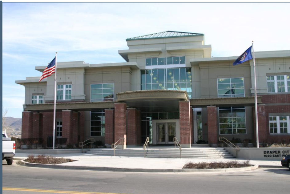
Draper City Hall (2011)

For Fiscal Year Ended June 30, 2019 CITY OF DRAPER, UTAH